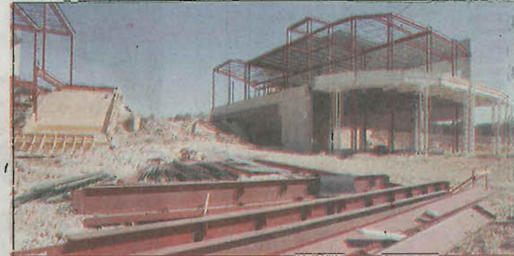
The future site of a set of escalators (left), two restaurants (right) and a fountain that will run between them.

"The success of The Shops at La Cantera has certainly resulted in a tremendous amount of interest and demand by other retailers who were not able to locate in the first phase."